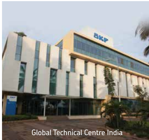
Global Technical Centre India