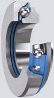
Solid oil bearing