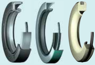
Seals for general industrial applications