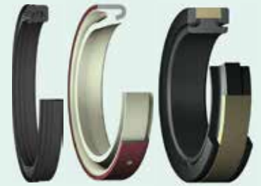
Fluid power sealing systems