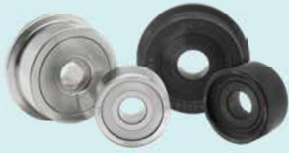
Extreme temperature bearings