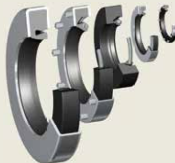
Large diameter seals