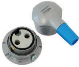
VZ130I & VZ140I