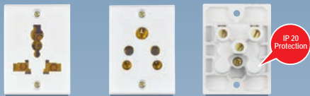
14305 14119 Urea Back